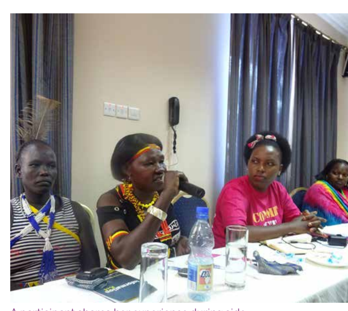
A participant shares her experience during side event on Maternal Health, Hotel Africana, Kampala