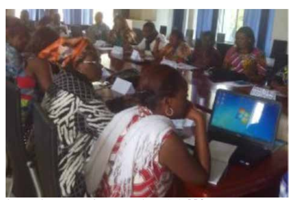
A women's movement for peace and security in DRC