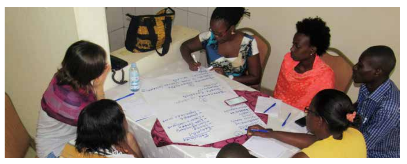
A section of participants working on a group exercise during the CVC training in Mukono, Uganda February 2017