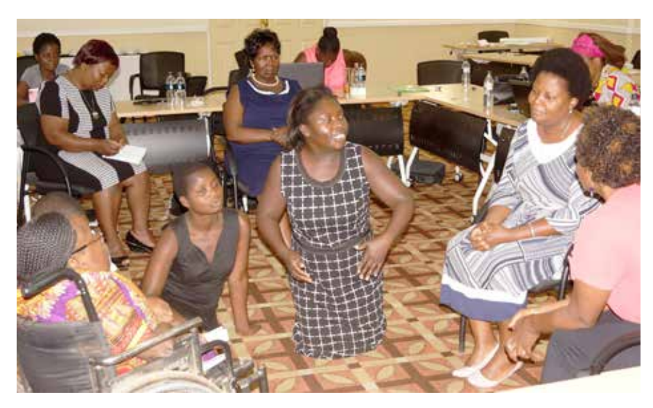
A group of participants performing a role play demonstrating different advocacy strategies, Lilongwe October 2016